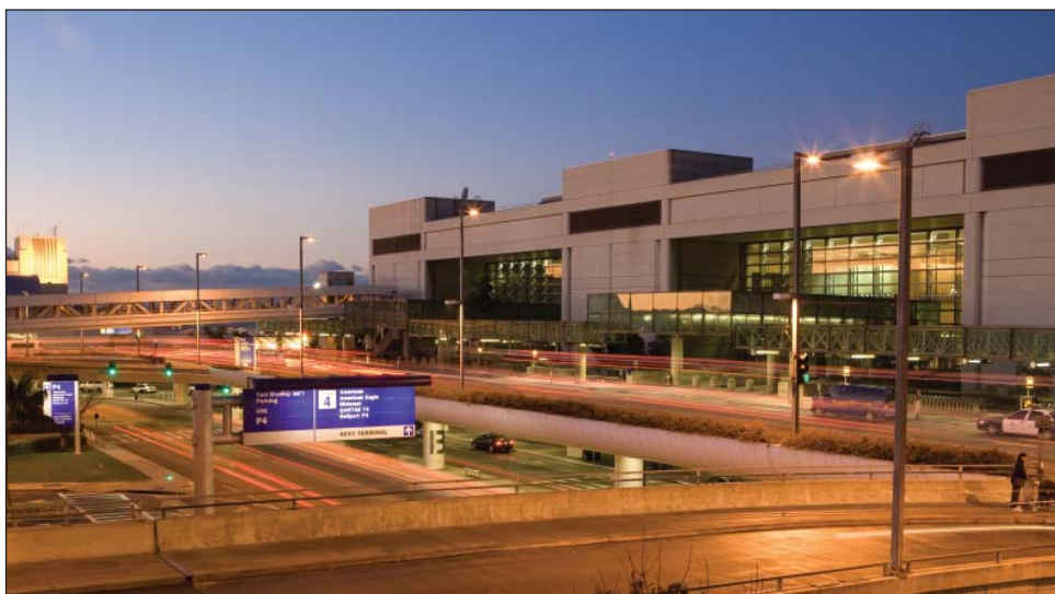
Clark/McCarthy performed one million square feet of renovation work at TBIT.