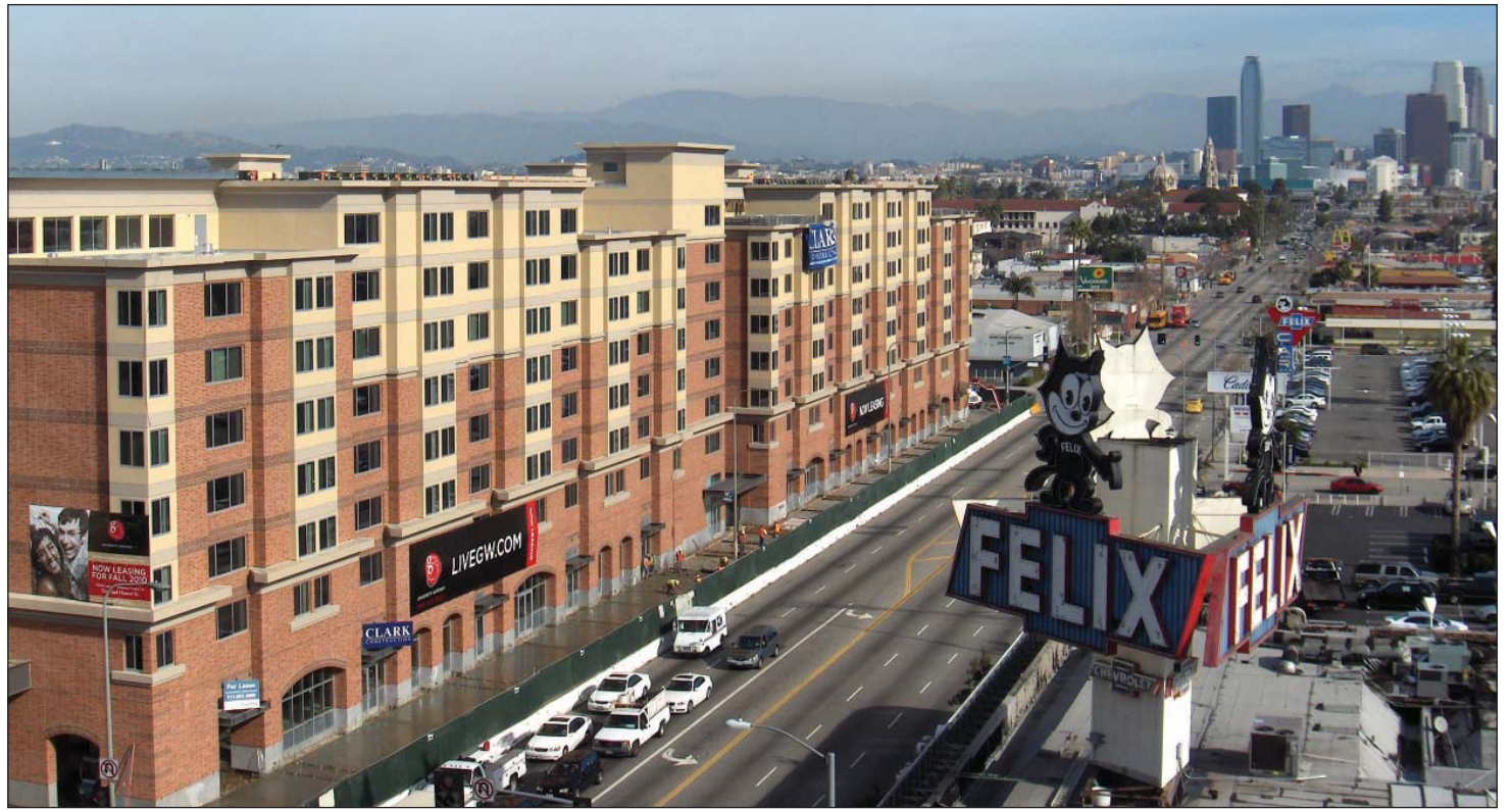
University Gateway, located directly across from the USC campus, also provides views of downtown Los Angeles

Though it is an off-campus housing facility, University Gateway was designed and built to extend the feel of the nearby USC campus. The structure's exterior of cement plaster, glass, and brick matches the predominant USC aesthetic. Open courtyards, roof decks, and landscaped exterior areas provide residents with convenient social spaces. Ample on-site bike storage and planned