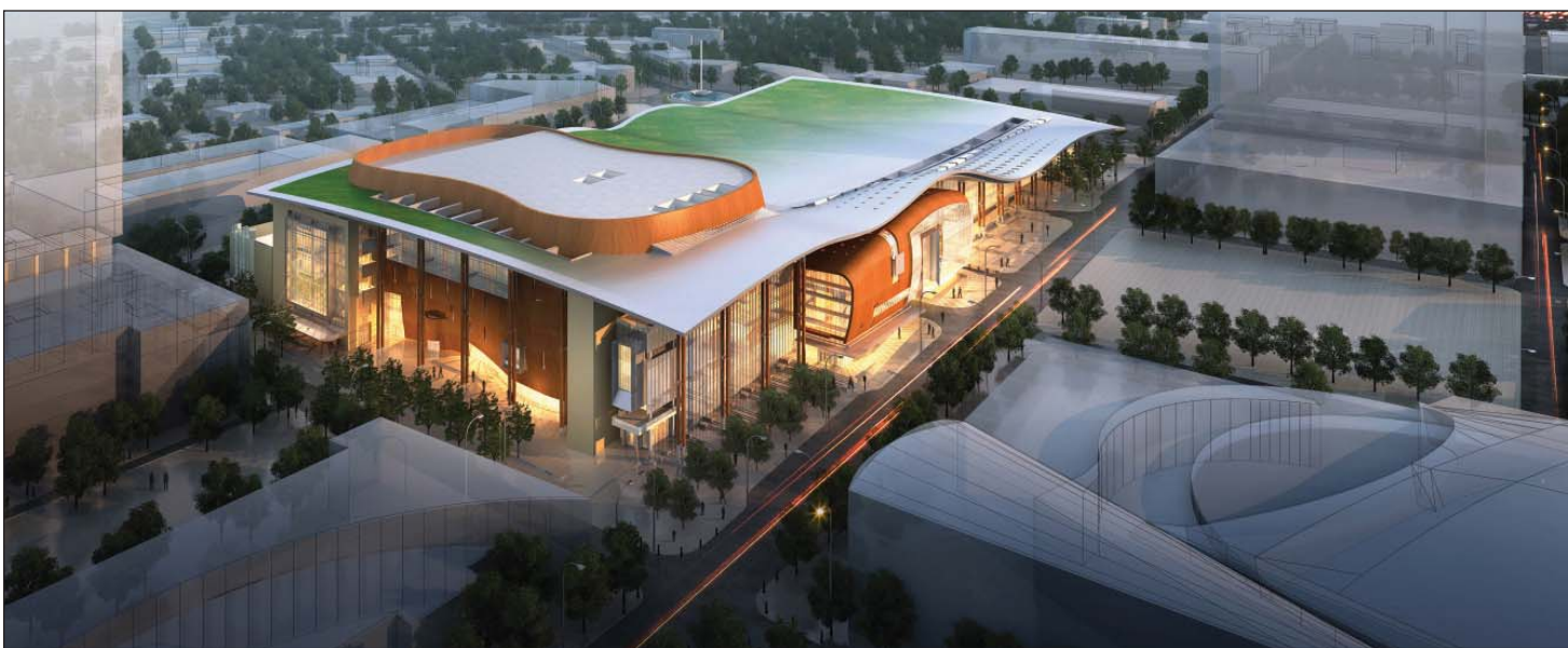
Music City Center, Nashville (Rendering courtesy of tvsdesign)

NASHVILLE – In February, construction began on Nashville's newest landmark: the 1.2 million square-foot Music City Center. The Bell/Clark joint venture team was selected as the convention center's general contractor in June 2008. A January 19 vote by Nashville's Metro Council paved the way for construction to begin on the $415 million project.