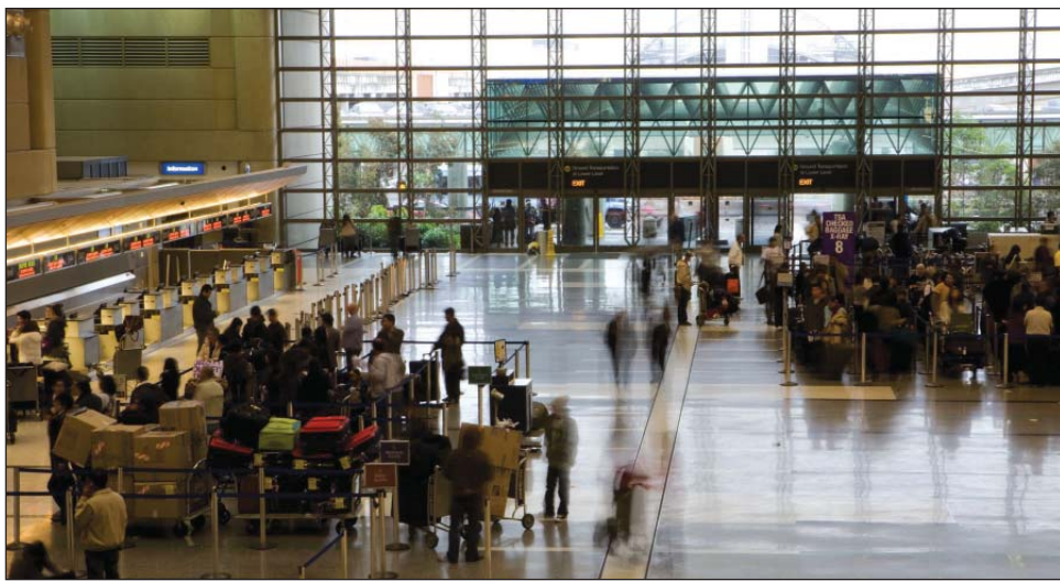
Everyday, thousands of people pass through TBIT, which remained fully operational throughout construction.

While working together, several of the Focus Teams helped develop an interactive process, Micro Phasing, which directly addressed the challenges of the large-scale renovation project. Different Focus Teams collaborated and developed ultra-detailed plans for narrow portions of the scope, allowing the overall project to proceed safely, on budget, and on schedule. Every major aspect of the project was Micro Phased, and the process helped form a cohesive group dynamic and brought innovative ideas to the table from all project stakeholders.