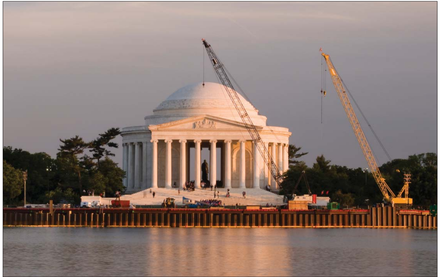
Work is underway on the Jefferson Memorial Seawall, Washington, D.C.

The seawall and the plaza have been subject to settlement since the memorial was dedicated and, by 1965, settlement of the North Plaza had reached three feet. Four years later, a reconstruction effort placed the plaza