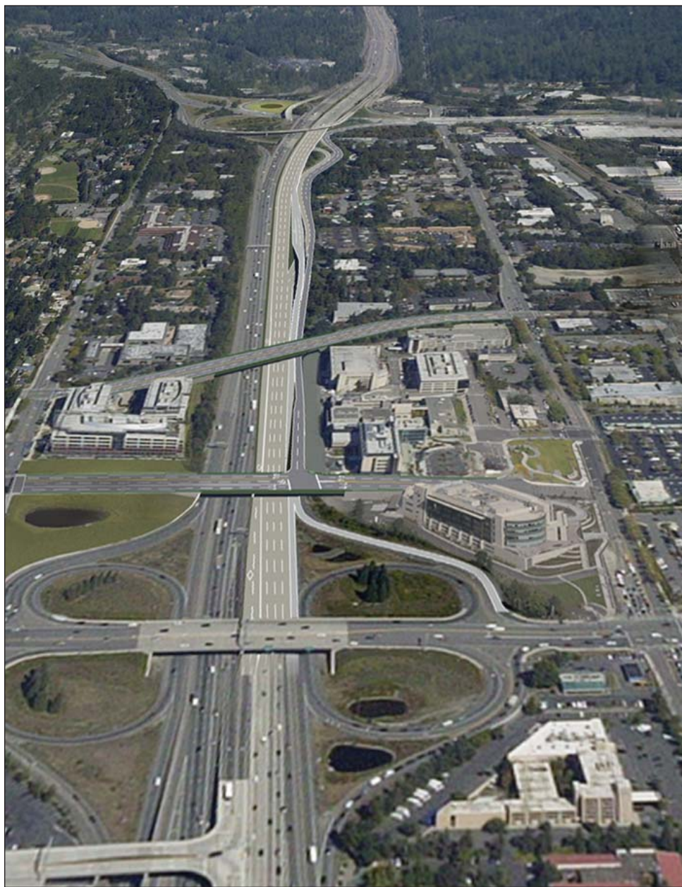
I-405, Bellevue Braids, Bellevue, Wash.

BELLEVUE, Wash. – Drivers traveling through one of the more congested portions of I-405 in Washington state are getting some relief thanks to the Washington State Department of Transportation (WSDOT) and Guy F. Atkinson Construction .