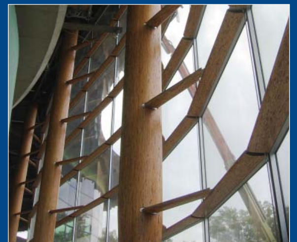
Arena Stage curtain wall, winner of the WBC Star Award for Technical Excellence.

Waterfront Station Special Construction – Thermal and Moisture Protection Calvert Masonry