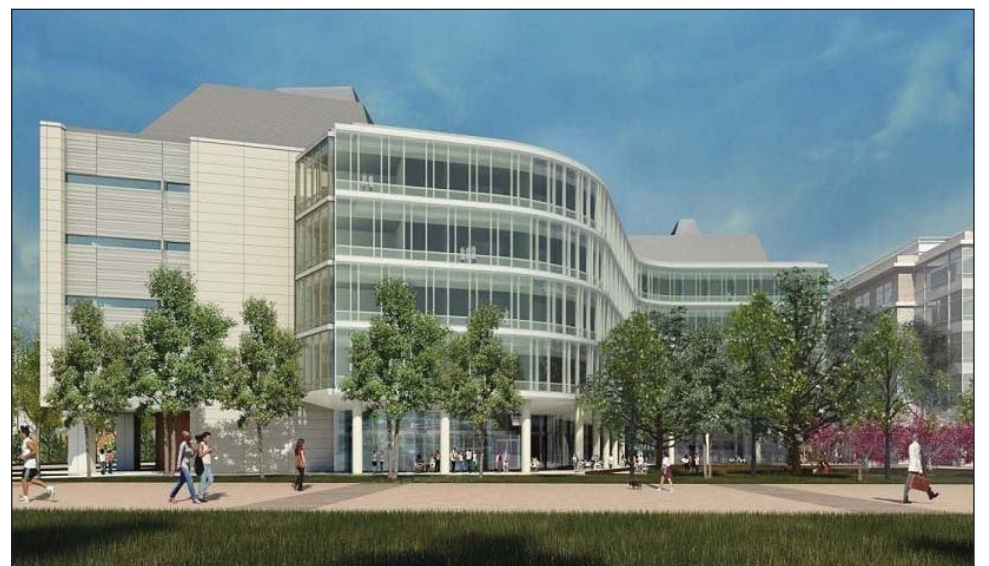
UCSF Neurosciences Building, San Francisco

Enveloped in curtain wall, metal panels, and precast concrete, the five-story building will accommodate 100 principal investigators, including Nobel Prize winner Stanley Prusiner, MD, director of UCSF's Institute for Neurodegenerative Diseases, as well as more than 500 additional researchers and staff. The first floor will be designed for clinicians and clinical researchers of the UCSF Memory and Aging Center, while the top floors will be dedicated to laboratory research. The facility also will include a conference space and a