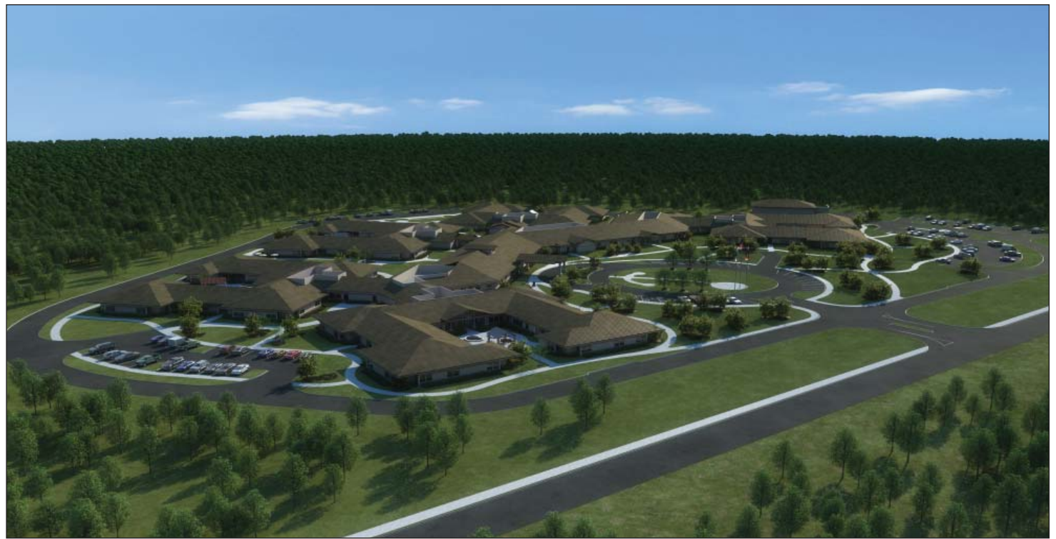
Veterans Home of California, Redding, Calif.

The Veterans Home of California, Redding is being designed to earn a minimum LEED® Gold certification. Many of the project's sustainable elements will enhance the residents' comfort and well-