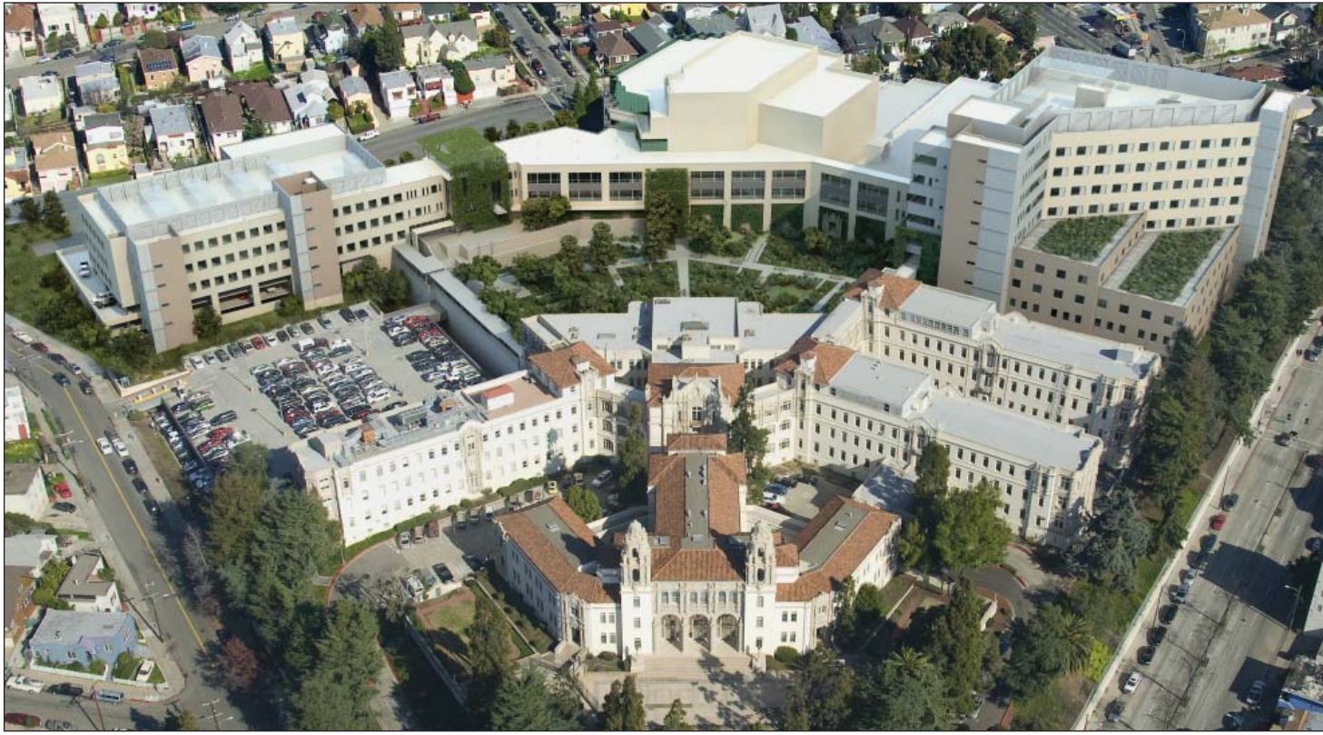
Highland Hospital Acute Tower Replacement, Oakland

OAKLAND – The County of Alameda Board of Supervisors awarded the construction of the Highland Hospital Acute Tower Replacement (ATR) project to Clark Design/Build of California, Inc. The design-build project, with a budget of $668 million, is necessary to comply with California state seismic requirements for healthcare facilities. This three-phase project will replace existing facilities at Highland Hospital, which originally opened in 1927.