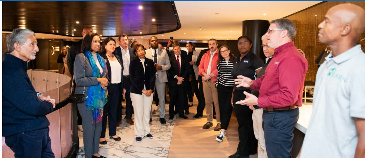
Ted Leonsis and Mayor Bowser hear from CBE leaders during recent arena tour.