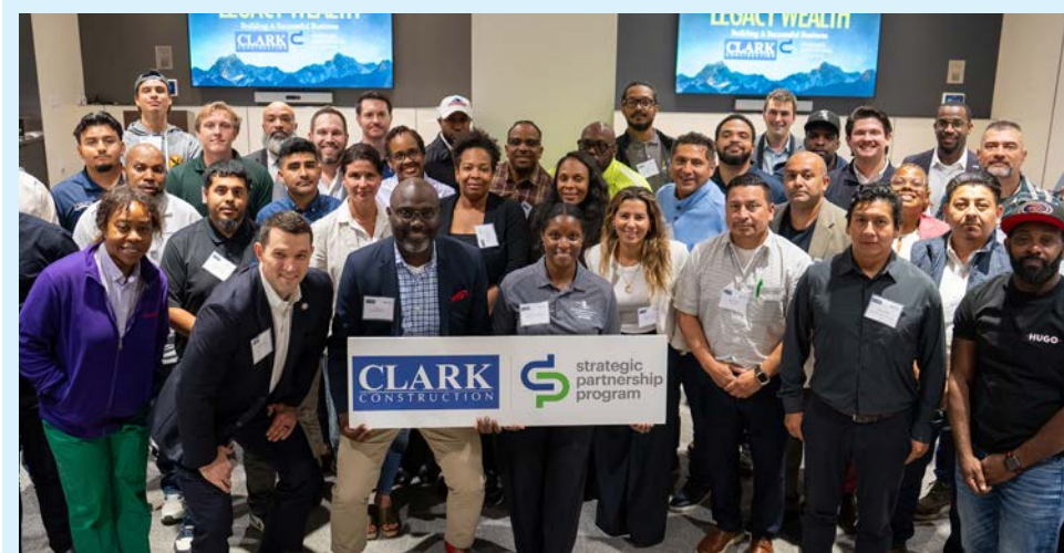
SPP's incoming class of small business leaders.