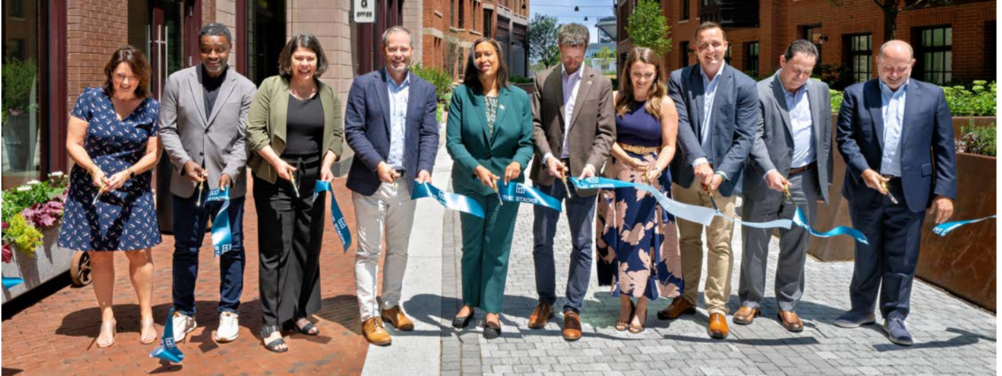
Mayor Muriel Bowser and representatives from National Real Estate Development and Akridge at The Stacks ribbon cutting event.