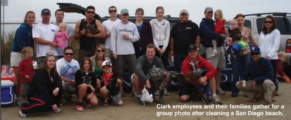
Clark employees and their families gather for a group photo after cleaning a San Diego beach.

SAN DIEGO – In May, nearly 30 Clark employees and their family members took part in a coordinated effort to clean San Diego’s beaches. The clean-up event was the first of three organized by the I Love a Clean San Diego organization and the local Adopt-A-Beach program. Founded in 1954, I Love a Clean San Diego is a nonprofit environmental education and outreach organization. The Clark volunteers plan on participating in future beach clean-up events.