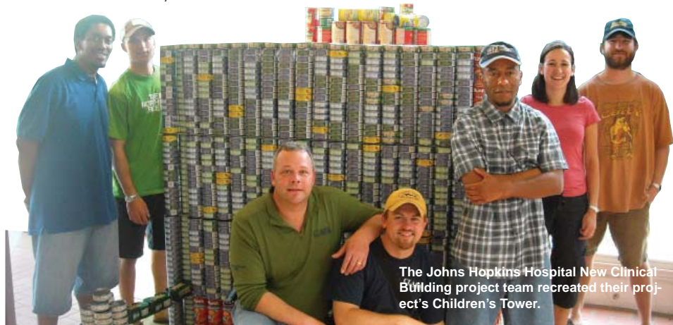
The Johns Hopkins Hospital New Clinical Building project team recreated their project's Children's Tower.

This year, the team recreated their project's Children's Tower and its curved, colorful curtain wall. The team used more than 2,200 cans of food to complete the model. After being on display for ten days at Baltimore's Inner Harbor, the competition's construction sculptures were disassembled and the canned goods were donated to the Maryland Food Bank.