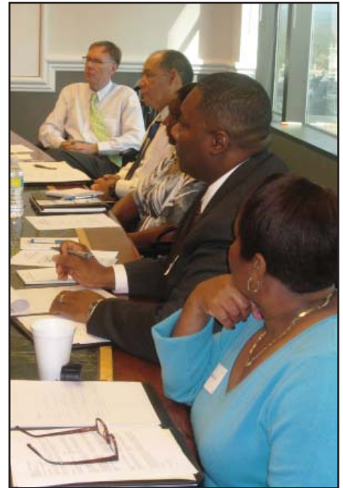
Participants in the “Job Readiness” day at Enable America’s Headquarters in Tampa.

The SAMMC-North project team also held two fundraisers for Enable America. The project team’s spring golf outing raised more than $20,000 and two special barbecue lunches netted more than $2,500 for the organization.