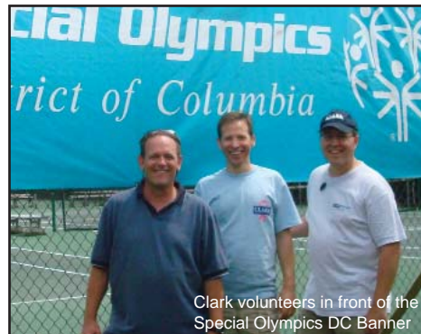
Clark volunteers in front of the Special Olympics DC Banner

Washington, D.C. – Three members of the Mechanical Infrastructure Upgrade project team spent a Saturday in May at Catholic University preparing for the 2010 Special Olympics DC Summer Games. The volunteers set up tents, temporary fencing, benches, and signage. From May 25-27, 500 athletes participated in the games, competing in events including track and field, soccer, tennis, volleyball, and bocce.