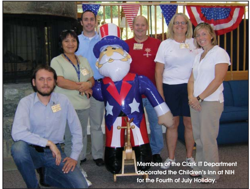
Members of the Clark IT Department decorated the Children's Inn at NIH for the Fourth of July Holiday.

BETHESDA, Md. – The Children's Inn at the National Institutes of Health (NIH), located just down the road from Clark's Bethesda Headquarters, was decked out in red, white, and blue this Fourth of July thanks to the effort of Clark's IT Department. Members of the department chipped in to purchase decorations to adorn the Inn, and several trekked down the road to put up the embellishments, which included: crepe paper, ribbons, centerpieces, flags, twinkle lights, and even an inflatable Uncle Sam.