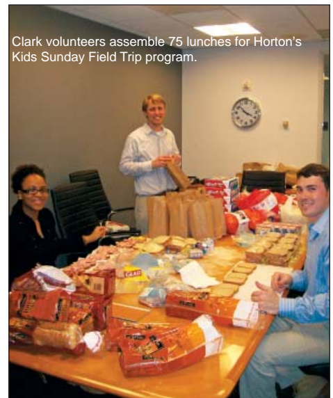
Clark volunteers assemble 75 lunches for Horton's Kids Sunday Field Trip program.

On two occasions this spring, Clark volunteers bought groceries and assembled 75 lunches for students participating in the organization's Sunday Field Trip program. The meals were delivered to the children before they embarked on their adventure. Whether attending a play, going on a picnic, or visiting a pumpkin farm for Halloween, these excursions allow children to leave their isolated neighborhood and explore new parts of the Washington, D.C., metropolitan area.