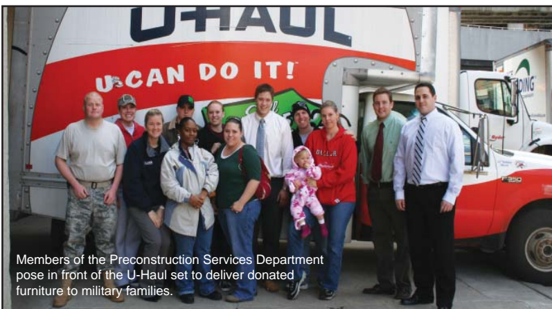
Members of the Preconstruction Services Department pose in front of the U-Haul set to deliver donated furniture to military families.

BETHESDA, Md.– Harsh February weather did not stop Clark's Preconstruction Services Department from collecting chairs, night tables, bake-ware, and over 10 televisions to benefit Airman's Attic. Located on Andrews Air Force Base, Airman's Attic provides gently-used goods for families of junior Airmen, rank E-1 to E-5. All items are free, easing the financial pressures on military families. Four collections were organized over the month of February and Clark employees went out of their way to drop off items, which in total, were enough to fill a U-Haul truck.