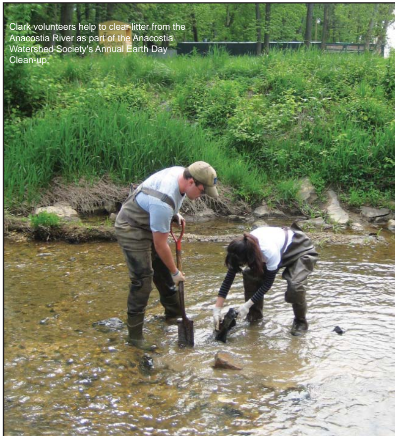
Clark volunteers help to clear litter from the Anacostia River as part of the Anacostia Watershed Society's Annual Earth Day Clean-up.

After the morning clean-up, several volunteers attended AWS's Earth Day Celebration event at Anacostia Park in Washington, D.C., and enjoyed a barbecue lunch, music, and commemorative presentations.