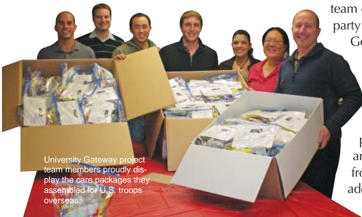
University Gateway project team members proudly display the care packages they assembled for U.S. troops overseas.

decrease in donations. To address this heightened need, and also to pay tribute to the 10th anniversary of the Holiday Contribution Program, Clark doubled the donation amount for each employee to $100, resulting in over $130,000 worth of donations to more than 460 deserving non-profit organizations.