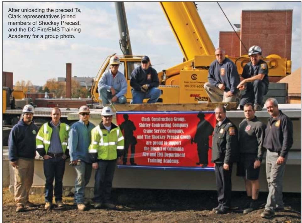
After unloading the precast Ts, Clark representatives joined members of Shockeyprecast, and the DC Fire/EMS Training Academy for a group photo.

Clark later worked with the training academy and members from The Shockeyprecast Group, Shirley Contracting Company, and Crane Service Company to coordinate the donation's delivery. The Ts, which stretched 55 feet in length and weighed nearly 55,000 pounds, were brought to the facility on flatbed tractor trailers. Following their arrival, a crew of volunteers, including Clark personnel, academy staff, and riggers and a crane operator from Shockeyprecast, set the Ts in place as a small crowd of firefighters watched in the distance.